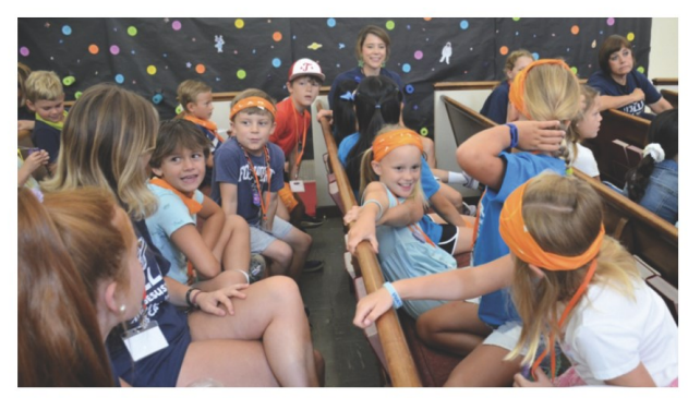
Join us for Kids Camp 2024 from July 8^{th} -12!!